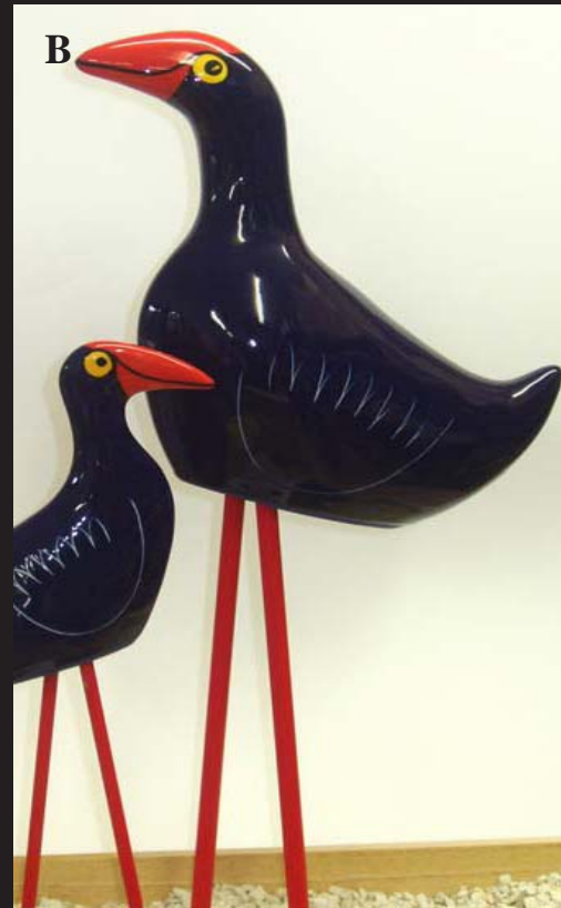
B. Large Pukeko 45cm tall #8 Large Pukeko #5 Original