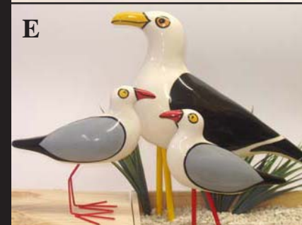
E. Black Backed Gull 40cm long Seagull with tubular legs 21cm long Seagull with springilegs 21cm long