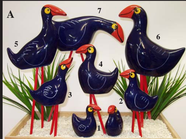
A. Pukekos with Tubular Legs #1 Hatchling pukekos 8cm tall #2 Mini 19cm tall #3 Baby 19cm tall

The tubular legs on the birds are easily removable and are made from powder-coated aluminium so they will never rust or fade. The springilegs are also easily removable, made from powder-coated steel and are intended for indoor use.